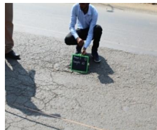
Fig. 1 : Images of onsite detection of cracks