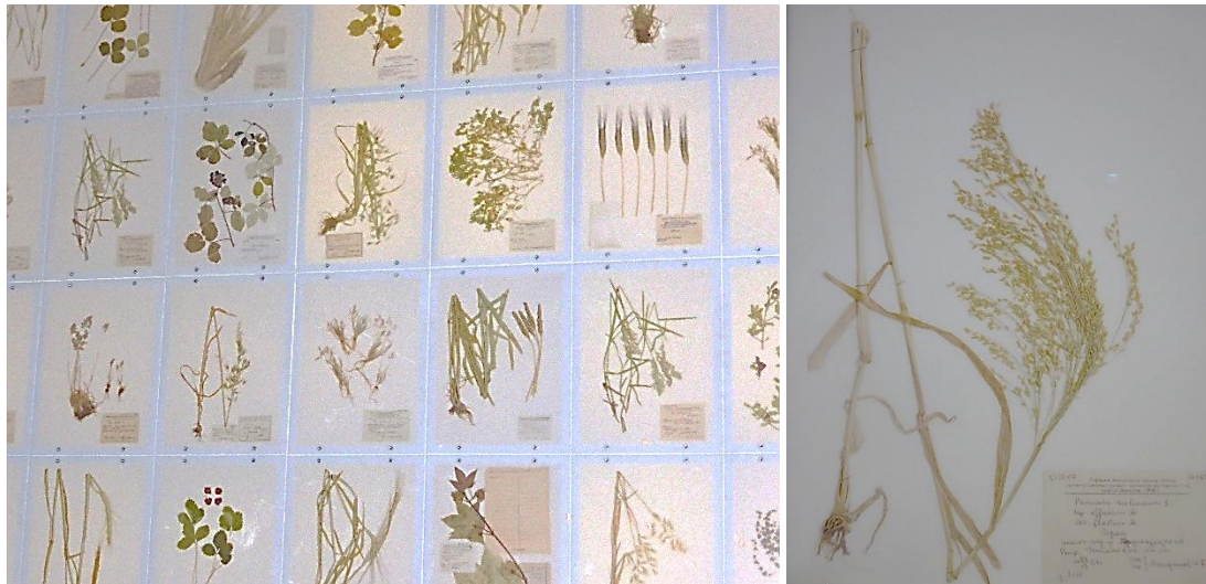
Display of the herbarium from the Vavilov Institute, Expo Milan, 2015

Big hope is put in preservation of plants and their different varieties in a frozen seed bank far from human influence and natural disasters, and many exist around the world 1 . The largest ones, mainly focusing on the crops for human consumption, are the Kew's Millennium Seed Bank Project in Wakehurst, England, the Svalbard Global Seed Vault in Northern Norway 2 , the Navdanya in Uttarakhand, India, the National Center for Genetic Resources in Fort Collins, Colorado and the Vavilov Research Institute in Russia. Their importance for the present and the future is not in discussion here, especially regarding catastrophes, because the seeds are meant to be protected from extreme weather events, local political events, economic instability and local climatic changes.