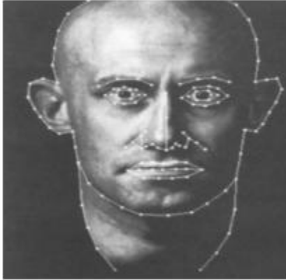
Fig 4: Field Morphing

In Figure 4, 127 sections are drawn over the forms and highlights of the face. In the twisting period of field transforming, correspondences are determined between the pixels of the pictures to be transformed. The calculation is called field transforming in light of the fact that each line fragment applies a field of effect on the arrangement to such an extent that pixels close to a portion in one picture will in general be lined up with pixels close to the comparing section in different pictures. Under a specific parameter setting, the calculation ensures that pixels on a fragment in one picture will be lined up with the pixels on the comparing section in different pictures. I will now initially clarify the field transforming strategy with only a solitary control line section and after that clarify the method with multiple control line segments.