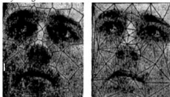
Figure 3: Triangulation of a face image using 80 distinct points. a) Voronoi diagram. b) Delaunay triangulation.

A few distinctive triangulation procedures can be utilized for triangulation of a lot of focuses. Triangulation of a lot of focuses is a procedure that is done in PC illustrations [15]. Delaunay triangulation [16] is a well known technique for ideal triangulation of a lot of focuses. To compute the Delaunay triangulation, Voronoi locales [16] ought to be acquired. Various immediate and backhanded development techniques are accessible for the Delaunay triangulation. The strategy that is received in this work is the blend of the quality triangular work age proposed by Ruppert [17] and the partition and vanquish steady Delaunay triangulation proposed by Guibas and Stolfi [16]. These two triangulation procedures have been accounted for to produce more exact outcomes than the current partners and to be quicker than them. A triangle is coded by its location (position) in the diagram. Voronoi chart and Delaunay triangulation of an example face picture is appeared in Figure 3. A lot of 80 unmistakable focuses are utilized for calculation of the Delamay triangulation.