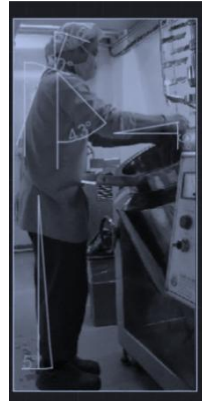
Figure 2. Worker Entering Material to a Machine

insert the material inside the sack) is 17.05 kgs. It breaks the rule of maximum weight for healthy body. That sack has very heavy load in it. When workers carries a sack more than 10 kgs continuously, it is considered dangerous and damaging body posture.