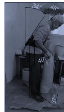
Figure 3. Worker Lifting a Sack of Powder

This action leads him to obtain MSDs, because he lift dozens of sacks daily during 8 hours of work. His body posture of work is not ideal posture to lift goods. Moreover, body muscles look too tense around hands, legs, back bones, etc. It is not good if workers do it everyday because it can cause damage to their body.