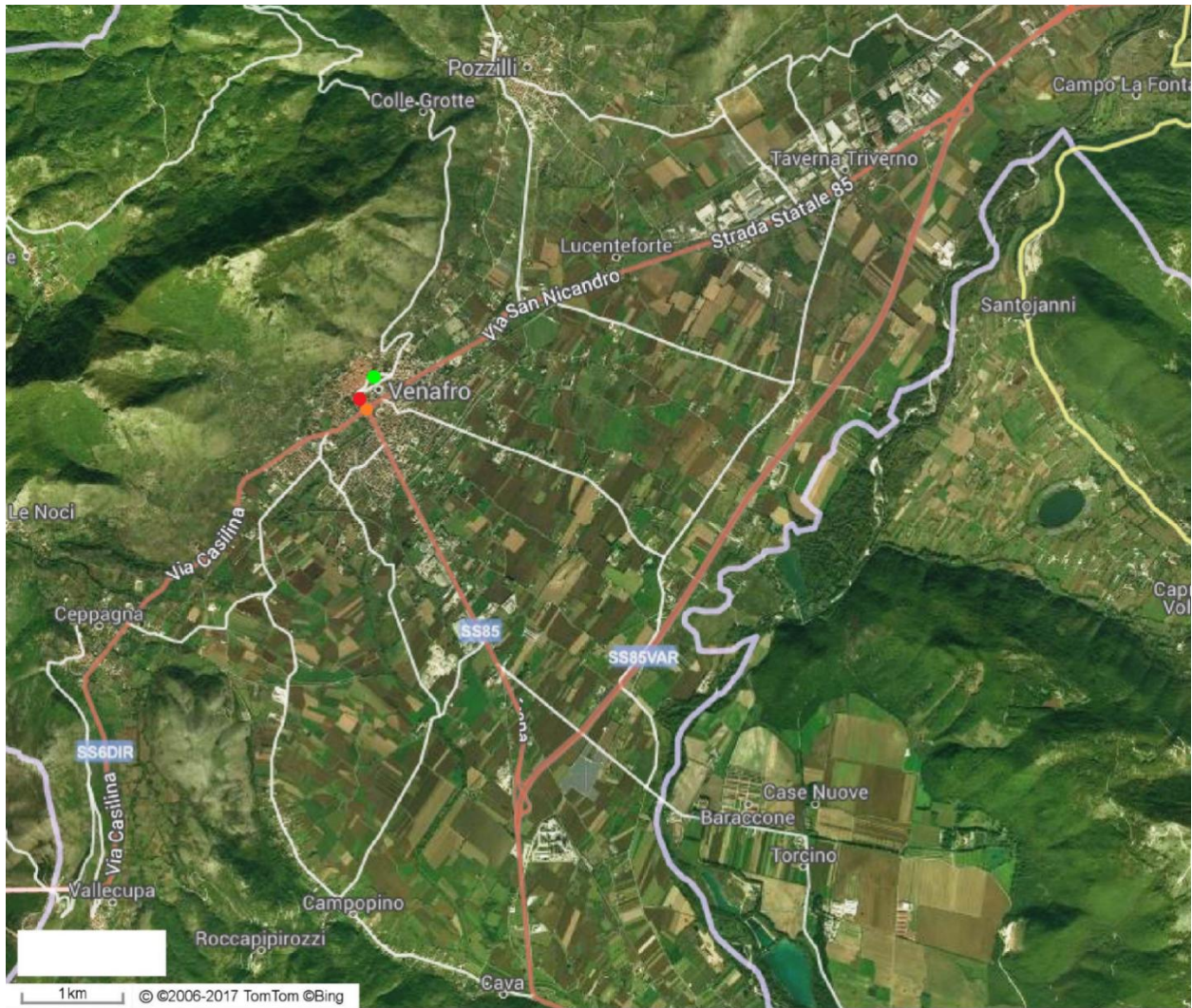
Figure 1. City of Venafrò (N 41 29, E 14 03). Image modified by the addition of three circles to represent the monitoring stations of Black Carbon.