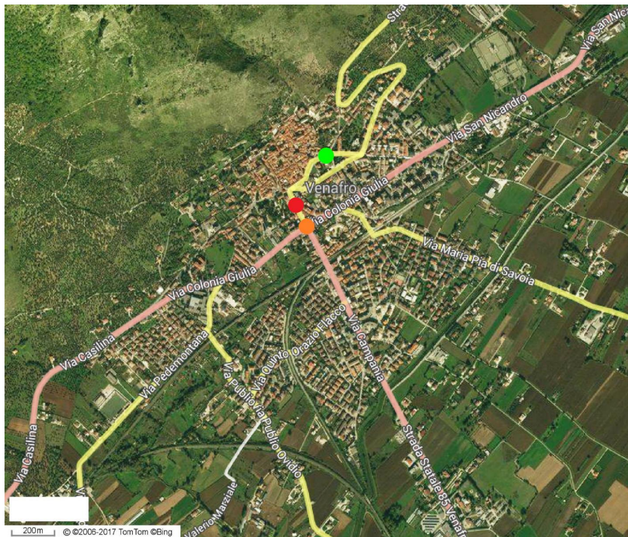
Figure 2. Monitoring stations of Black Carbon. Green circle: “Piazza Vittorio Veneto” (N 41° 48 59 10, E 14° 04 59 40); Orange circle: crossroad of “Via Colonia Giulia” and “Corso Campania” (N 41° 48 29 85, E 14° 04 47 88); Red circle: “Vico 1 Anfiteatro” (N 41° 48 37 58, E 14° 04 42 86). Road in rose color indicate high traffic volume roads.

to be representative of baseline BC exposure in Venafro (Figure 2).